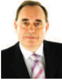
The Rt Hon Alex Salmond MSP MP